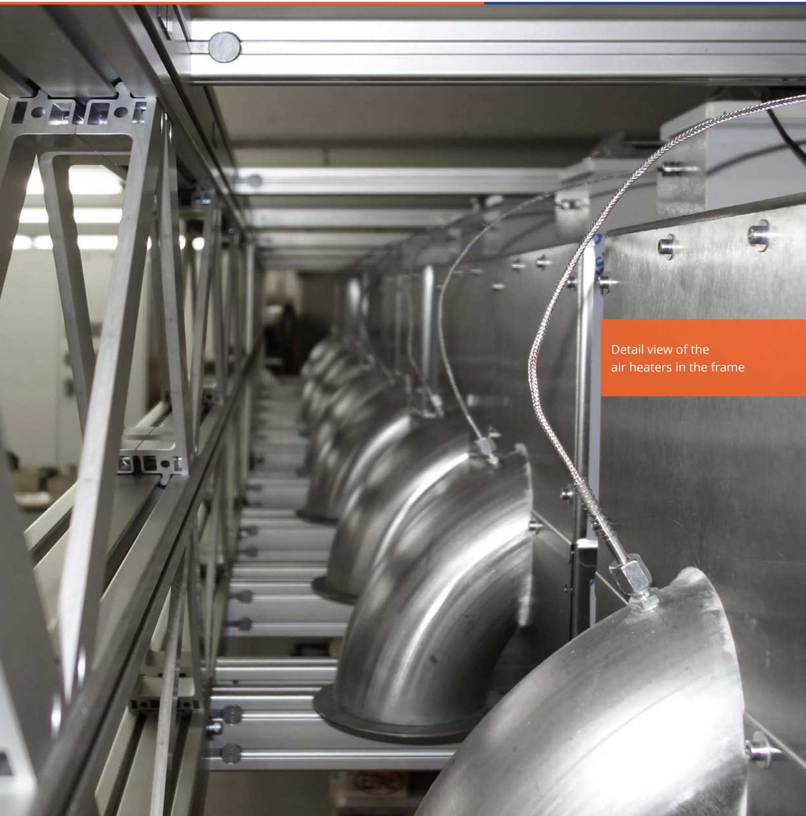
Detail view of the air heaters in the frame

Many thanks to ESGE Tech, Moers, for the authority to show the photos.